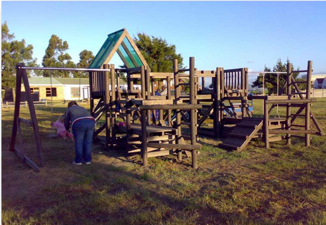
Figure 2: dimensions of the structure

Total Value of Items / Services more than R 30 000.00