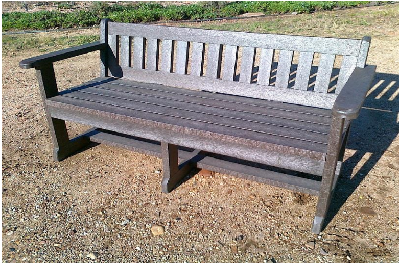
Figure3: Garden Bench with back rest