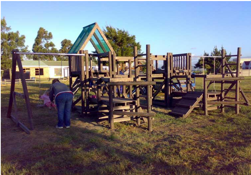
Figure1: Double jungle gym